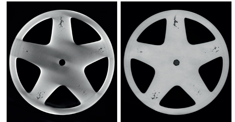
Eliminating unwanted gray-value gradients: Cone-beam CT without (left) and with Beam Hardening Correction (right).