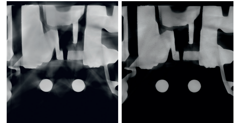
Improving image quality: Cone-beam CT without (left) and with ScatterFix 2.0 (right).

With complex components consisting of plastics and metals, MAR significantly reduces the interfering effects causing the less dense material to 'disappear'.