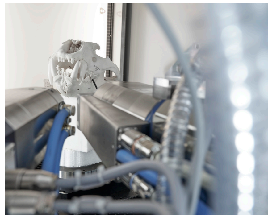
The flexible system with dual-tube set-up covers a wide range of applications.