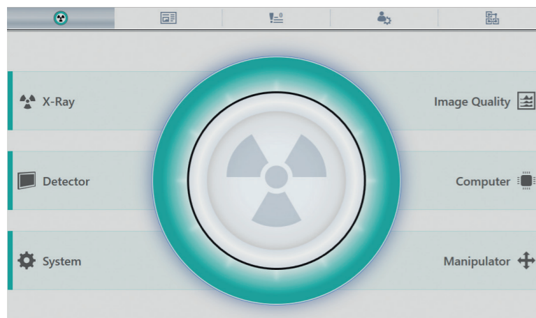
Geminy's Healthmonitor shows the current system condition.

As the single user interface for all workflows, Geminy uses automation, wizards and presets to guide users of different skill levels smoothly through the inspection process. In addition, its powerful CT techniques facilitate the optimum part size spectrum, speed, and image quality.